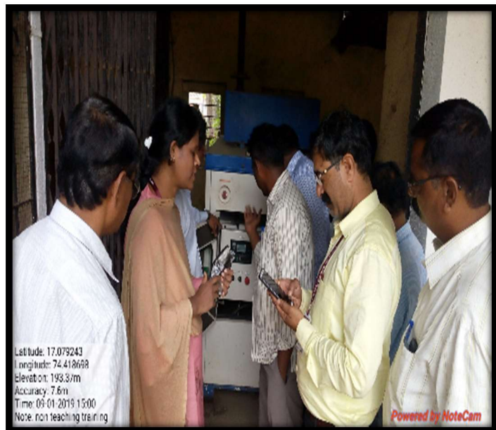
Non Teaching staff was learned the generator